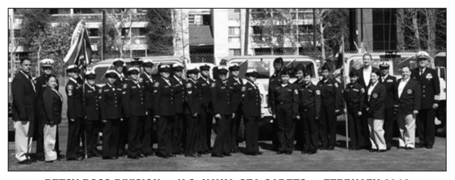
BETSY ROSS DIVISION — U.S. NAVAL SEA CADETS — FEBRUARY 2013

Our program is for 11 to 14 year olds under the Navy League Sea Cadets, and for 13 to 17 year olds under the U.S. Navy Sea Cadets Corps. Both programs are managed by adult staff officers dedicated to providing and instilling our core values. These officers may be civilians, former cadets or military (active, reserve or retired) that are knowledgeable of youth programs and interested in Cadet training.