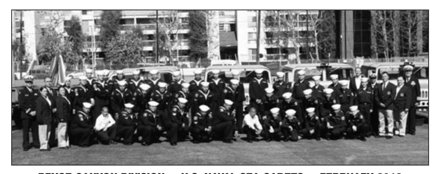
BRYCE CANYON DIVISION — U.S. NAVAL SEA CADETS — FEBRUARY 2013